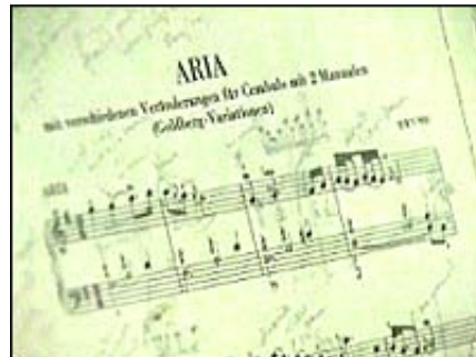
"You can't assume that what a person's going to hear is the same as what's on a written score."