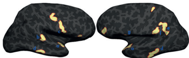
Figure 2. Between-subjects surface-based average showing greater response for song versus speech stimuli.

The intersubject surface-based average song versus speech subtraction is shown in Figure 2. In both hemispheres, there was increased response associated with song perception along the anterior temporal plane considerably anterior to Heschl's gyrus and on a small patch of cortex on the MTG. In addition, there was extensive response on the left SMG, the right posterior superior temporal gyrus (STG), and the left IFG. Finally, there was significant response on the inferior PCG in the right hemisphere but only a small equivalent on the left. (Talairach coordinates of the areas showing greater response in the song condition, as compared with the speech condition, are listed in Supplementary Table S4.) No areas were found to be significantly more activated by the speech stimuli than by the song stimuli.