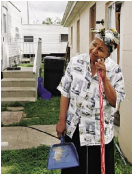
TRAILER LIFE , such as that in New Orleans's Lower Ninth Ward, has incubated feelings of isolation and despair.